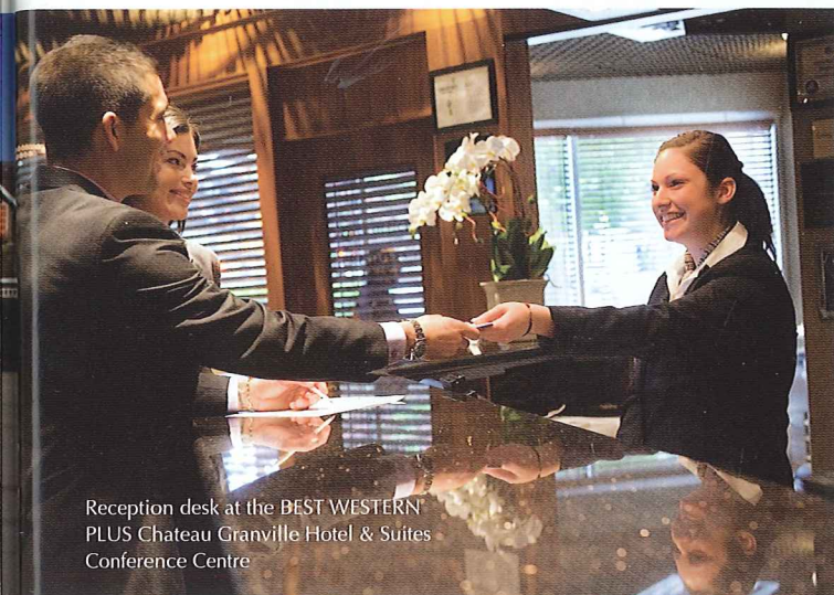
Reception desk at the BEST WESTERN PLUS Chateau Granville Hotel & Suites Conference Centre